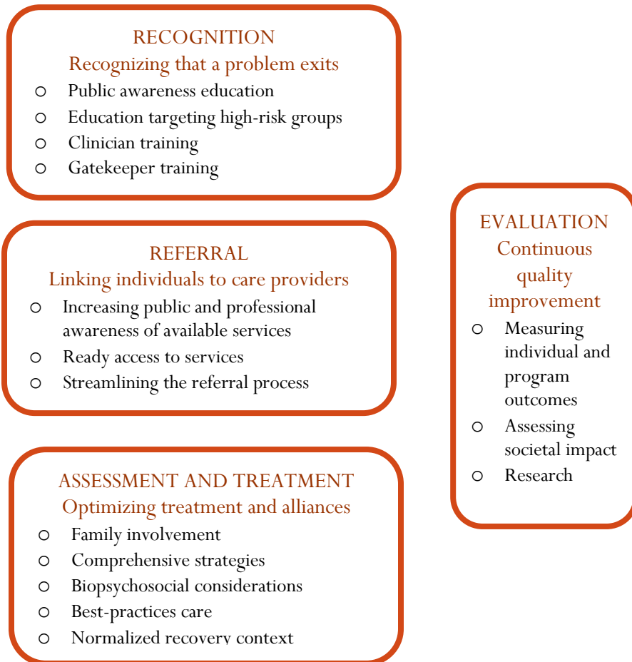
FIGURE 1: FUNDAMENTAL COMPONENTS OF EARLY PSYCHOSIS INTERVENTION

practices. The following figure outlines the fundamental components of early psychosis intervention, and details regarding these components are explained within the standards listed later in this document.